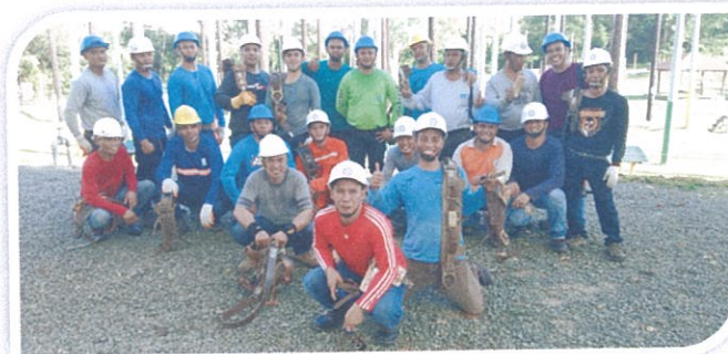
Basic Lineman Training Course November 5 to December 1, 2018 Meralco Power Academy, Antipolo, Rizal