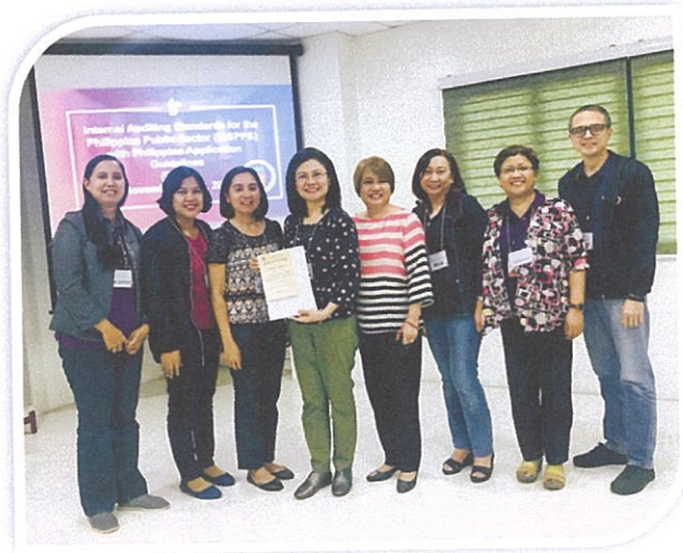
Seminar on Auditing by COA November 26-29, 2018 COA Professional Development Office, Commonwealth Ave., Quezon City