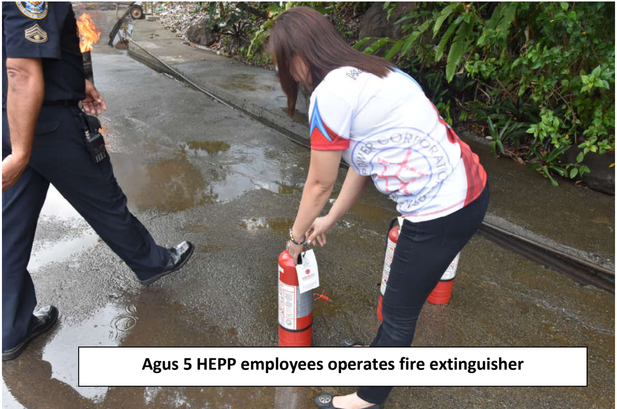
Agus 5 HEPP employees operates fire extinguisher