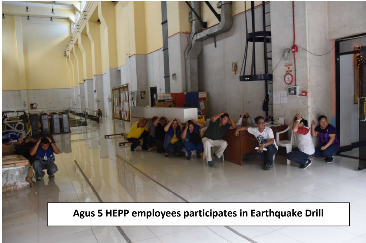
Agus 5 HEPP employees participates in Earthquake Drill