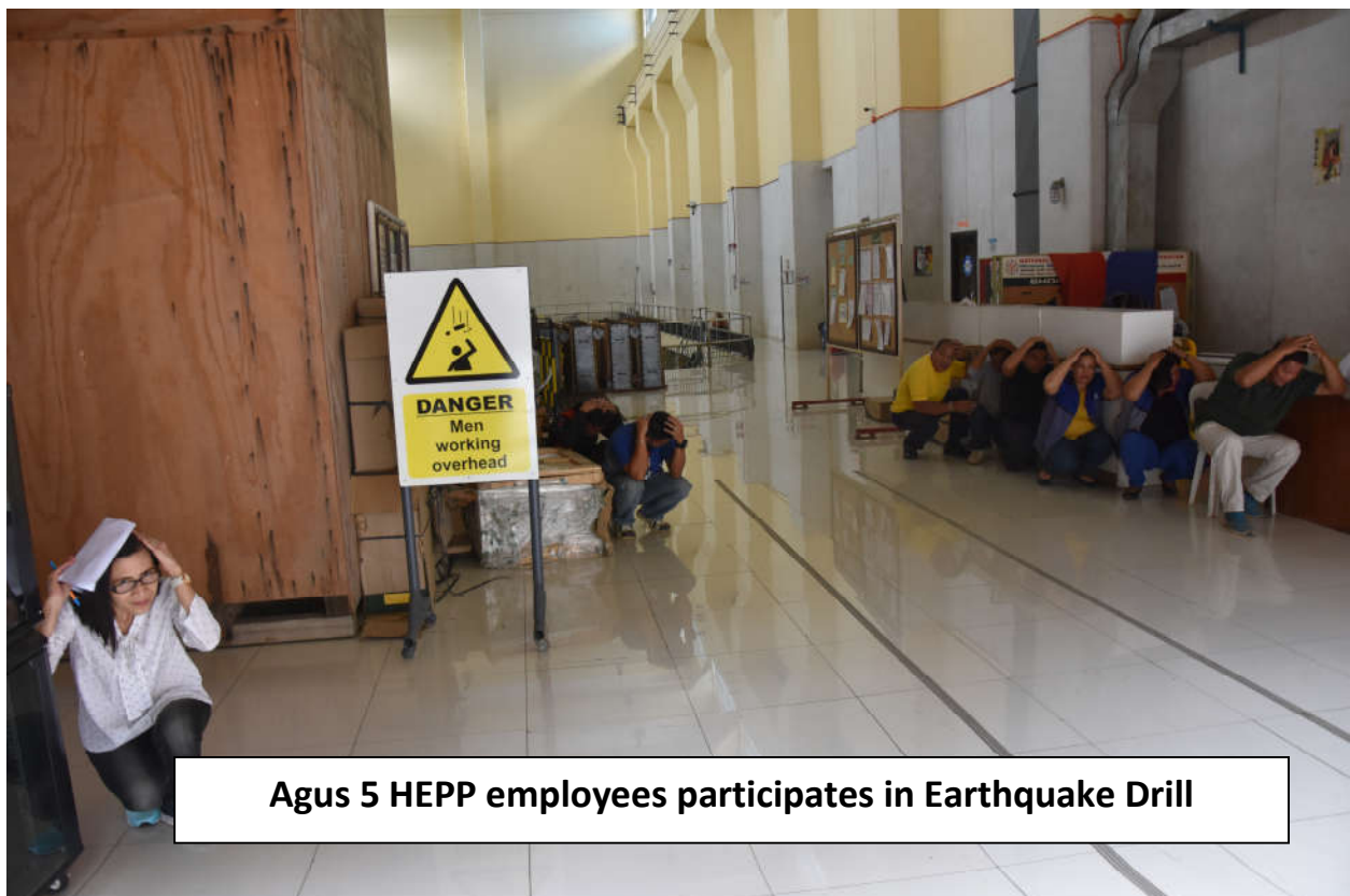
Agus 5 HEPP employees participates in Earthquake Drill