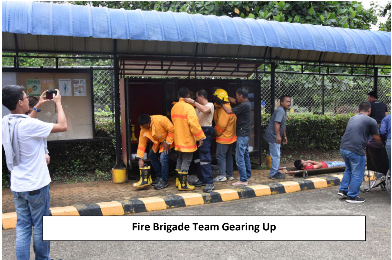
Fire Brigade Team Gearing Up