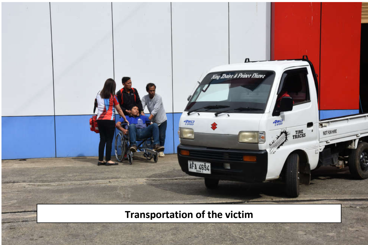
Transportation of the victim