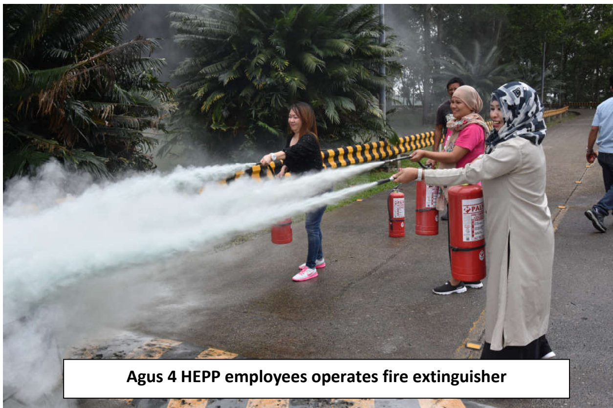
Agus 4 HEPP employees operates fire extinguisher