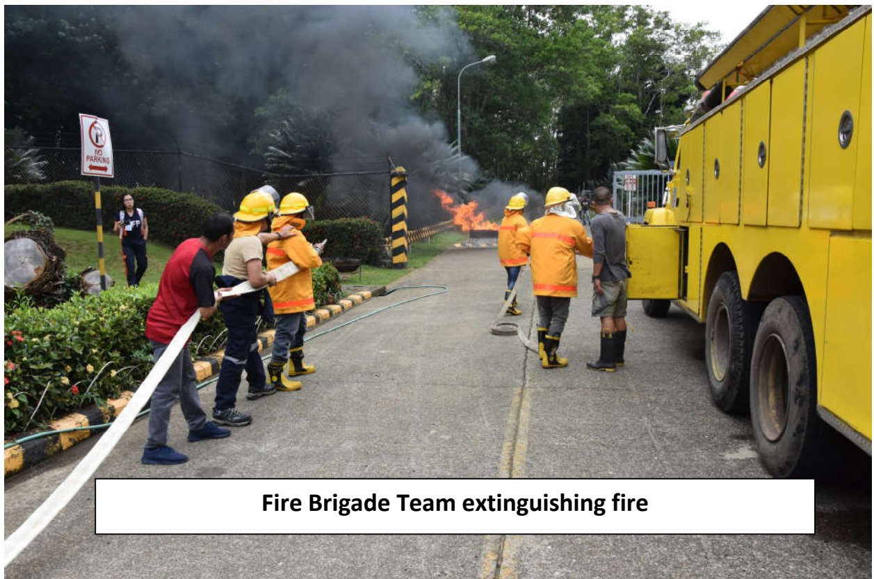
Fire Brigade Team extinguishing fire