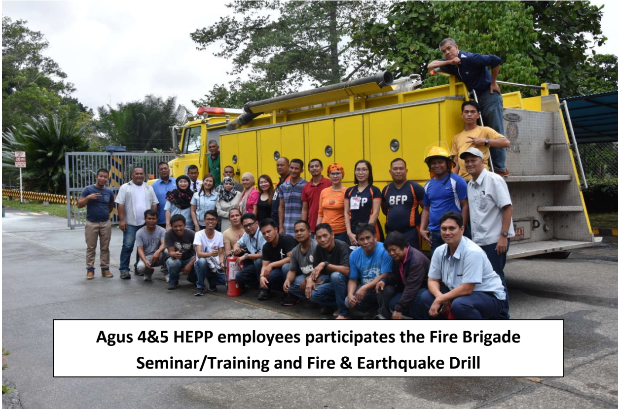
Agus 4&5 HEPP employees participates the Fire Brigade Seminar/Training and Fire & Earthquake Drill