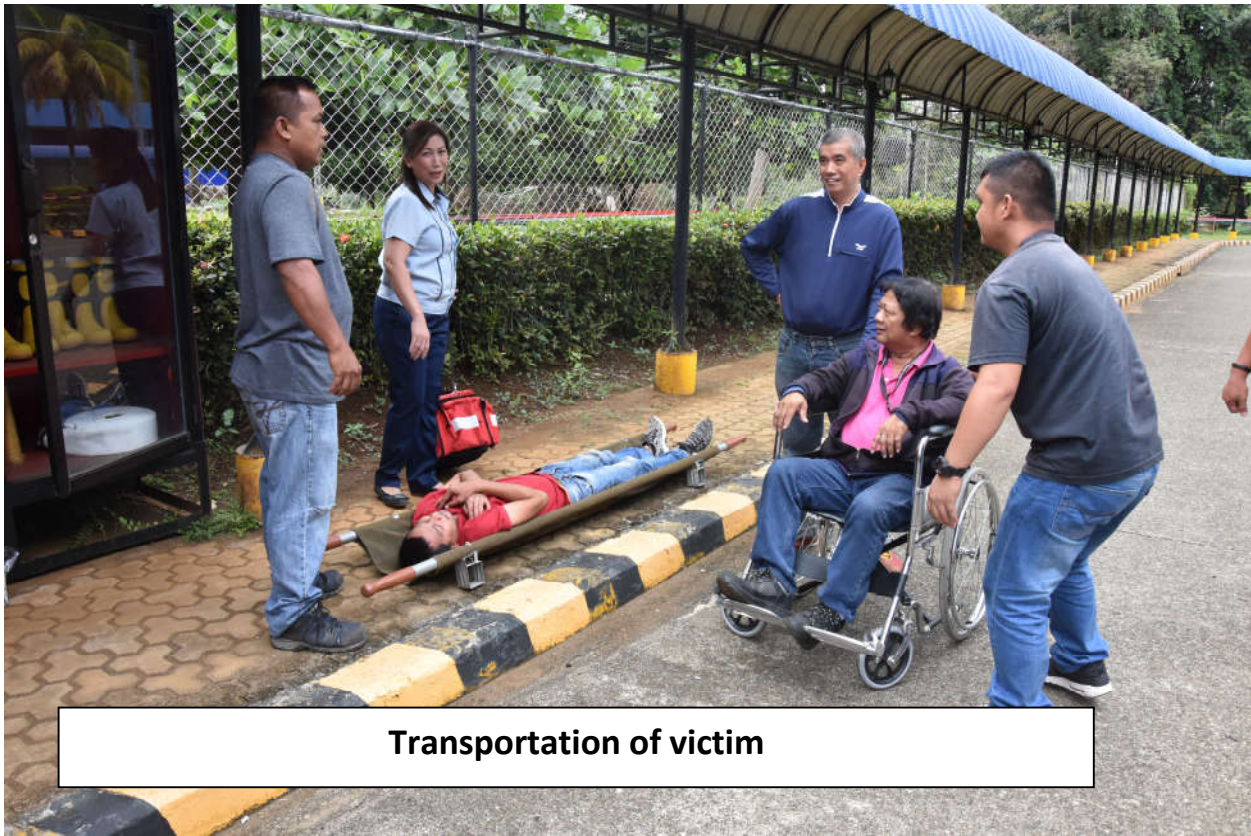
Transportation of victim