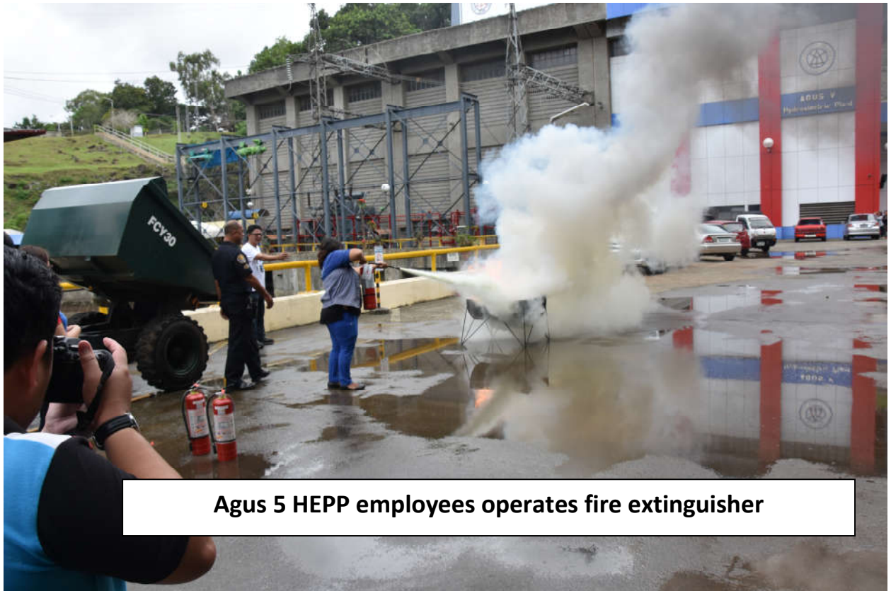
Agus 5 HEPP employees operates fire extinguisher