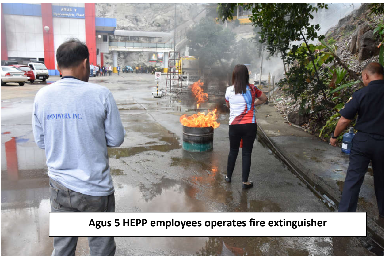
Agus 5 HEPP employees operates fire extinguisher