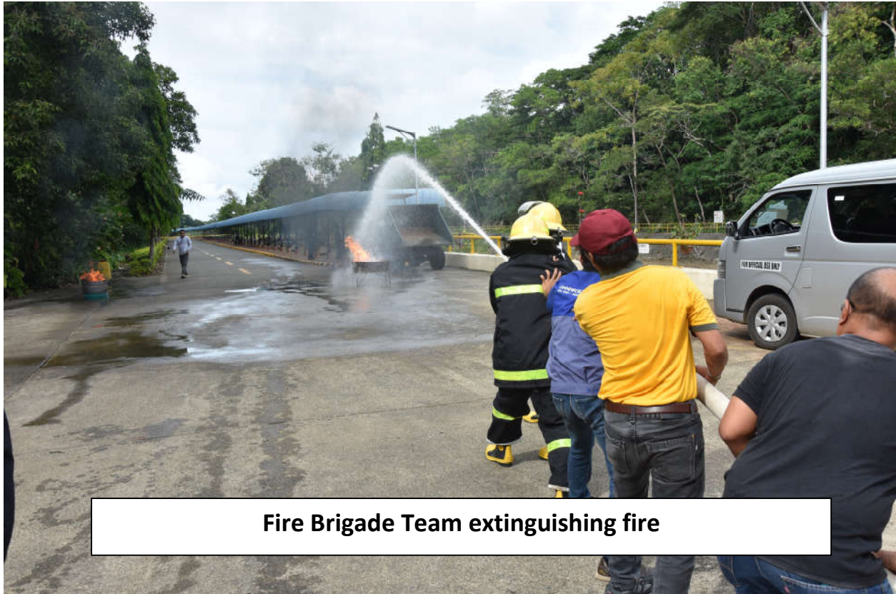
Fire Brigade Team extinguishing fire