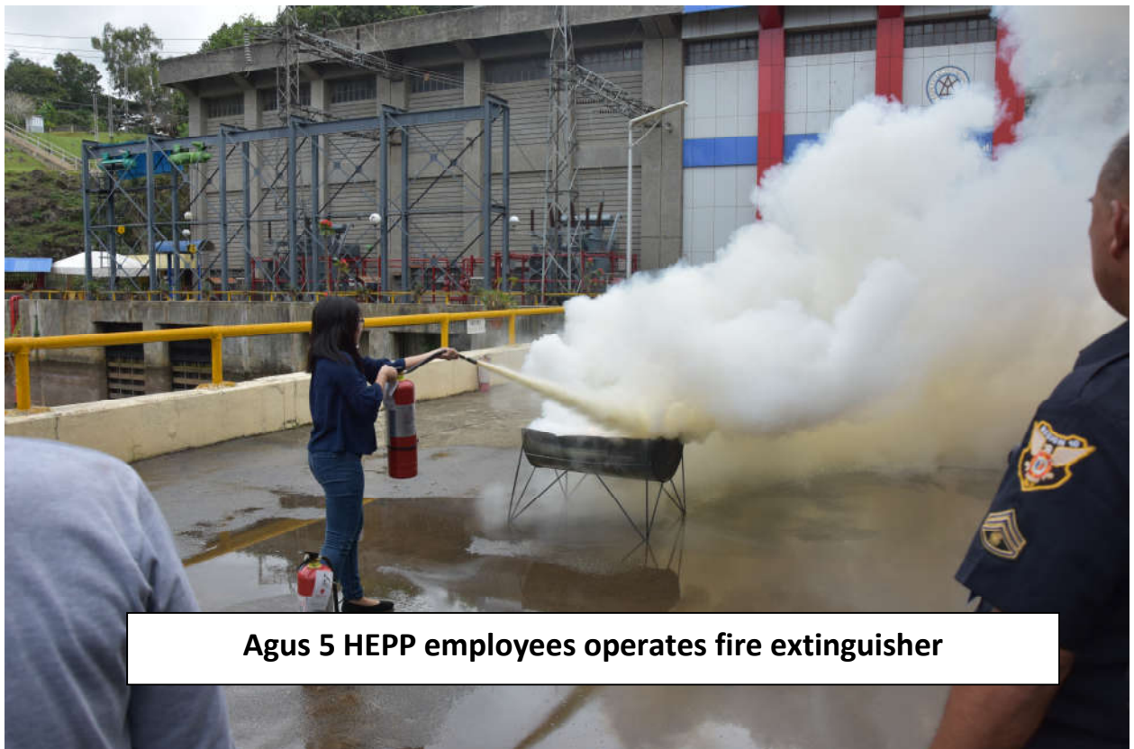
Agus 5 HEPP employees operates fire extinguisher