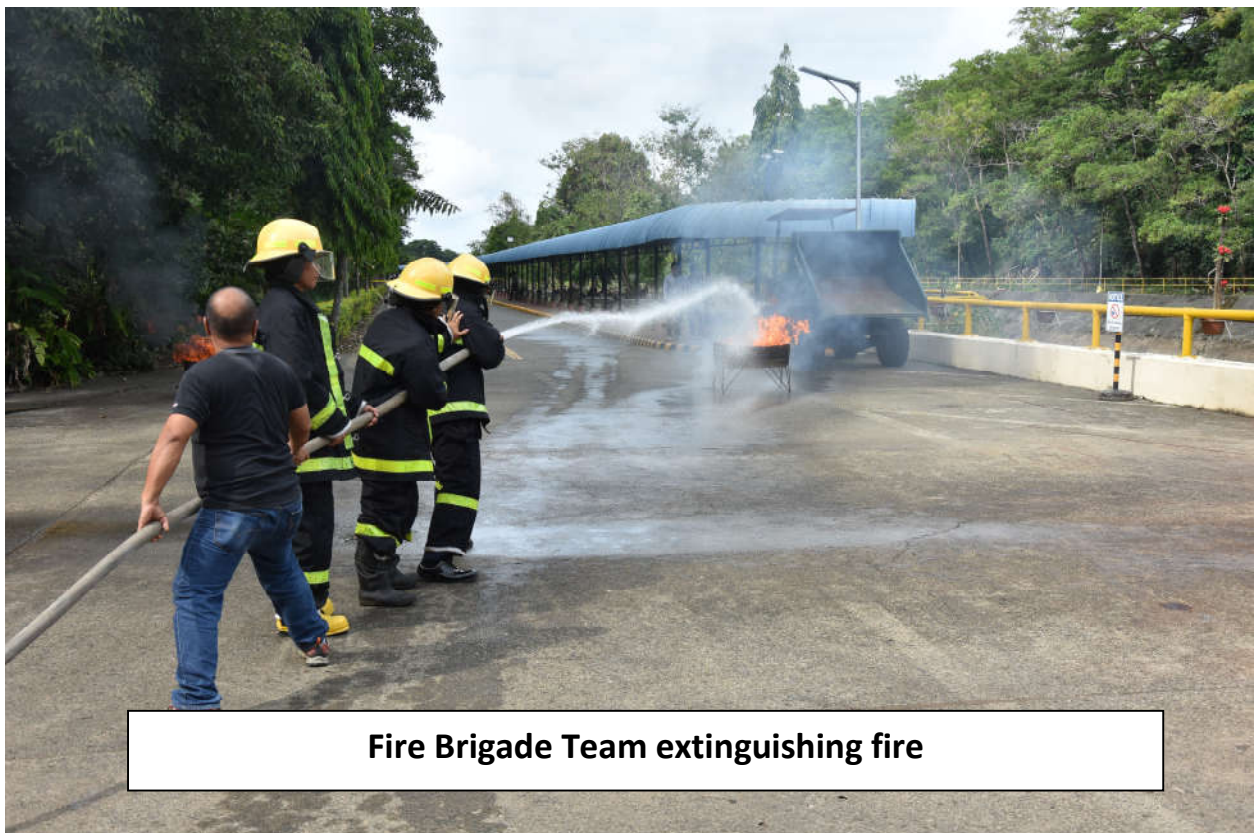
Fire Brigade Team extinguishing fire