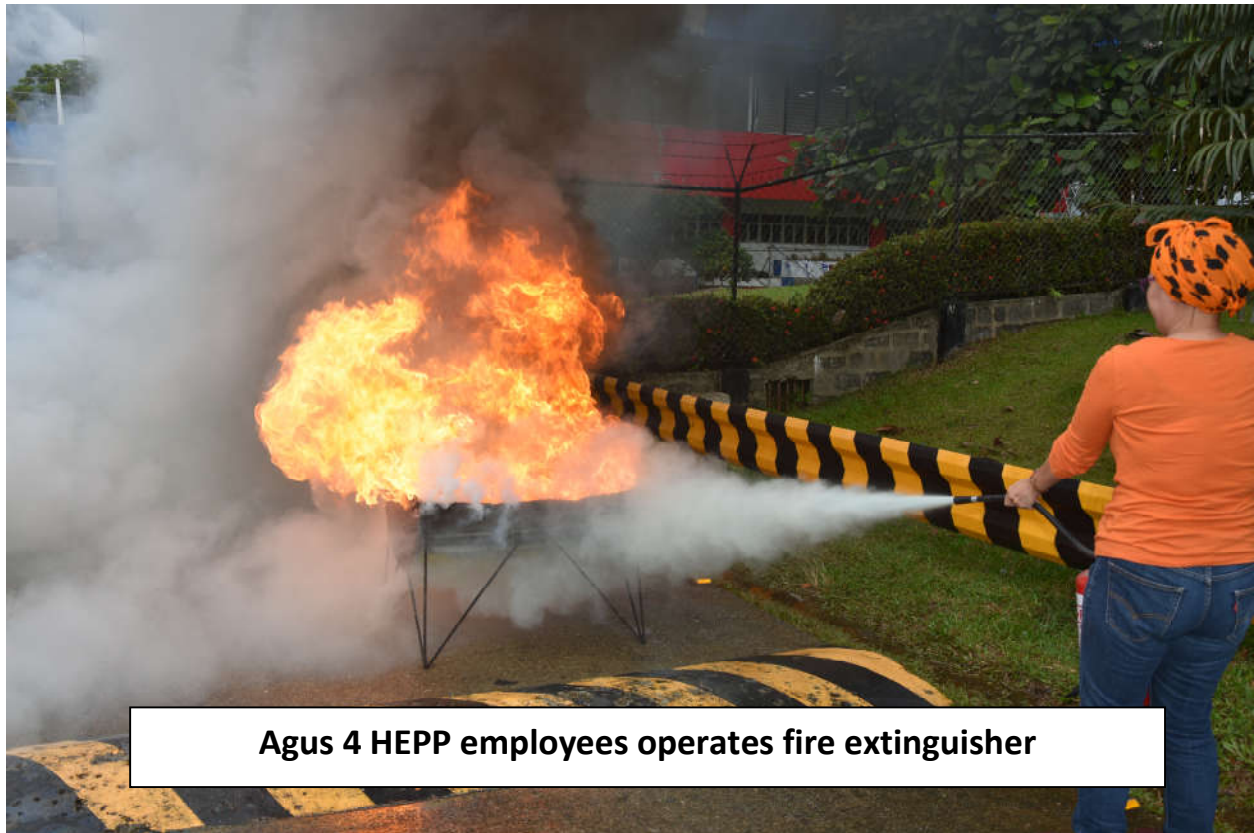
Agus 4 HEPP employees operates fire extinguisher