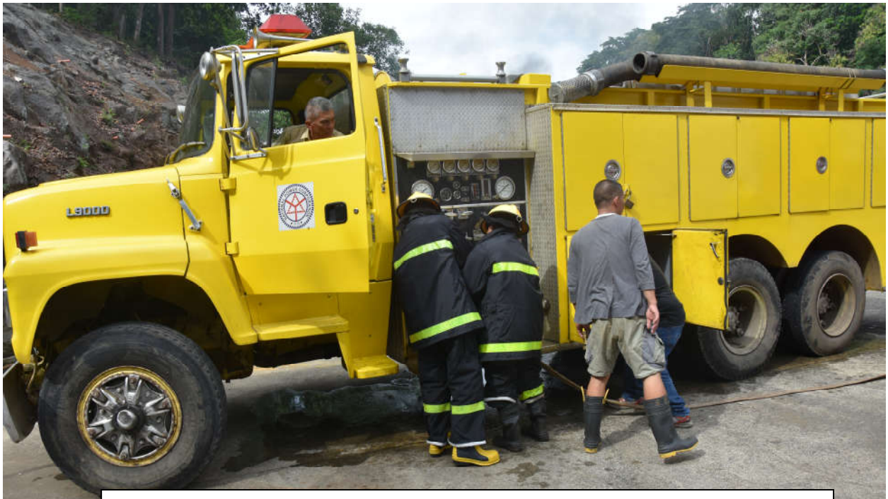
Fire Brigade Team extinguishing fire