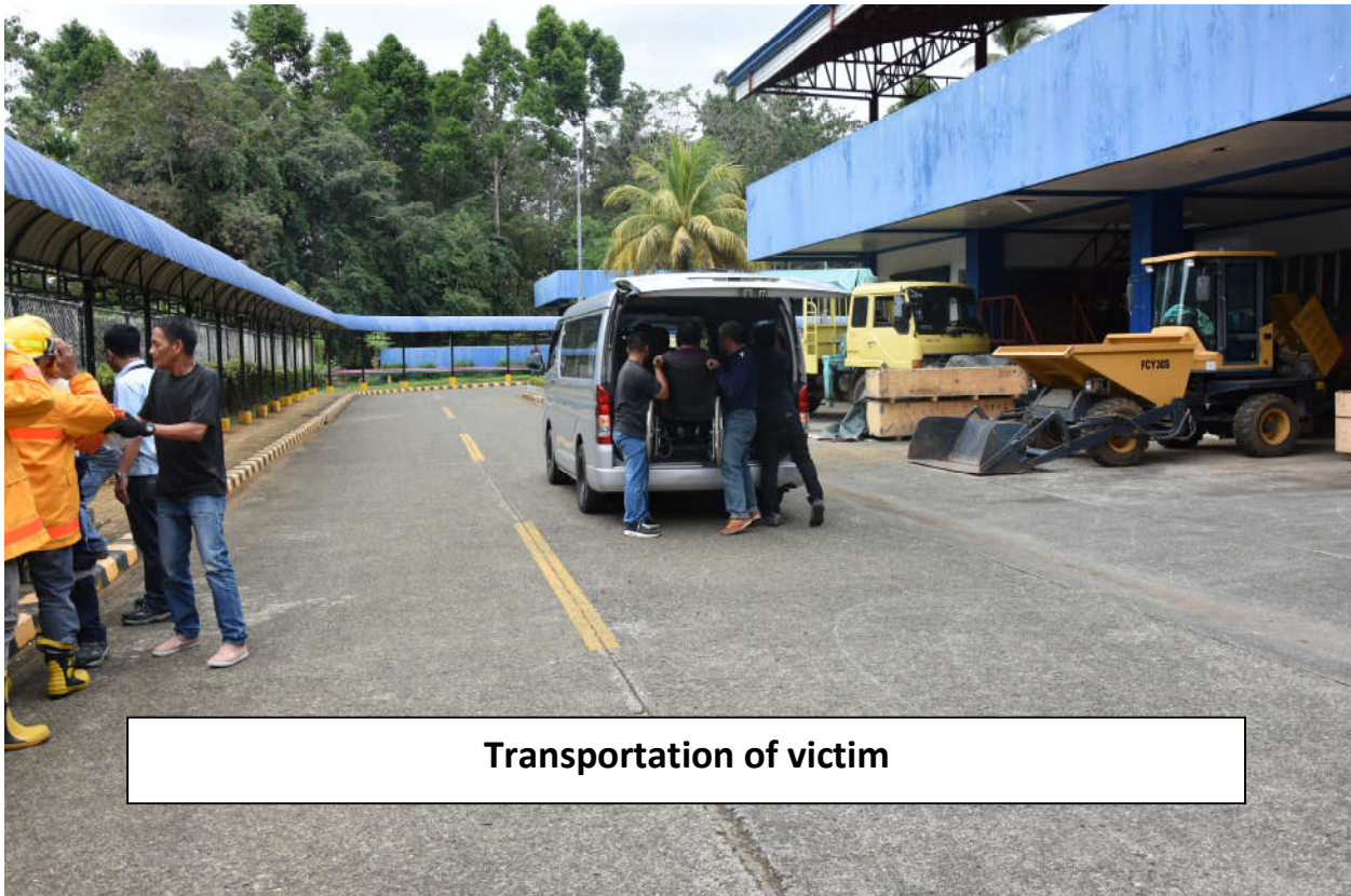
Transportation of victim