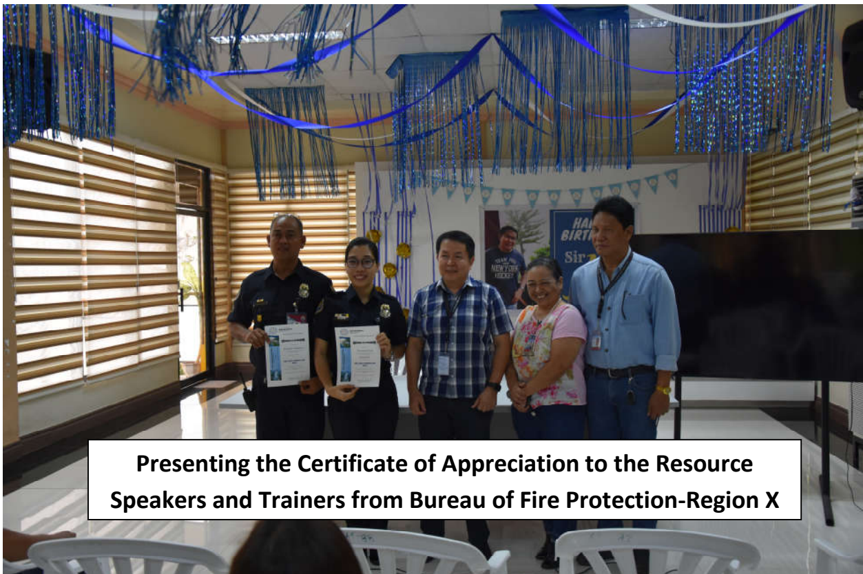
Presenting the Certificate of Appreciation to the Resource Speakers and Trainers from Bureau of Fire Protection-Region X