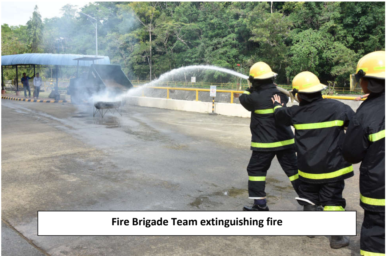
Fire Brigade Team extinguishing fire