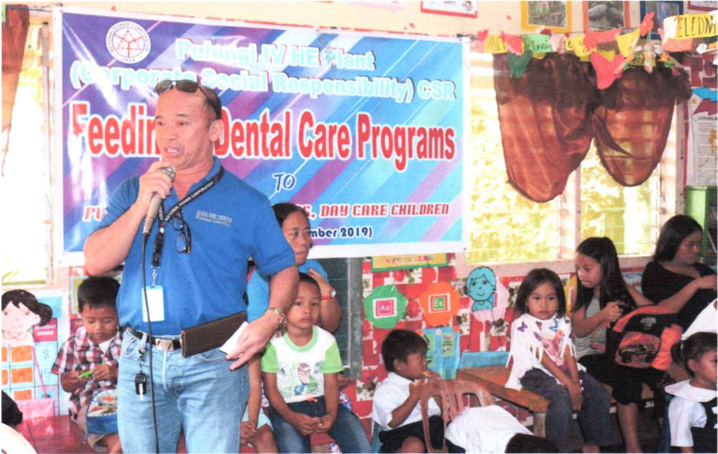
Distribution of dental kit and conduct of lectures on dental and health care by the Plant's Retainer Dentist and Physician to the Daycare parents and children of Purok 7, Camp I, Maramag, Bukidnon