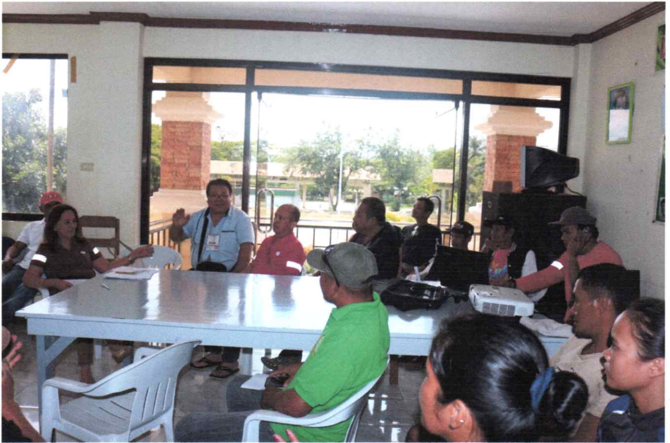
Continuing dialogue with the Fisherfolks empowering their livelihood along the Pulangi IV HE Plant reservoir with fishing as their source of income.