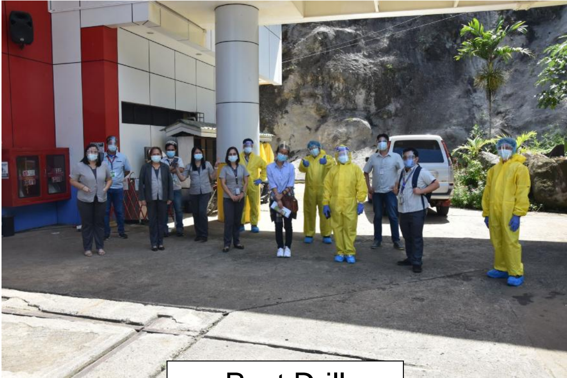
Post Drill Pictures