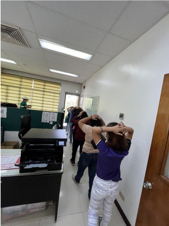
At Administration Building